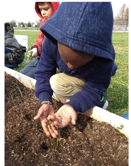
1 st Grade Student Planting Lettuce Seeds