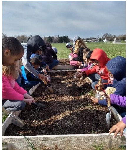
1 st grade students plant radish and lettuce seeds as part of a spring garden lesson.

The Gardens at School Working group lead by the Frederick County Master Gardeners continues to partner with elementary schools to provide hands-on gardening opportunities that align with grade-level classroom curriculum. During this F2S planning grant year, each of the 5 elementary schools in the F2S pilot project had gardening opportunities. Through the partnership with the Frederick County Master Gardener Program , two of the elementary schools received a start-up grant of $250 to buy supplies, build raised garden beds, and purchase soil. The remaining three elementary schools either already had raised garden beds or else after school garden clubs, F2S and the Master Gardeners offered support and hands-on experiential learning and the FSNE Educator offered resources: Youth Gardening for Nutrition and Growing Healthy Habits Gardening and Nutrition Education Curriculum .